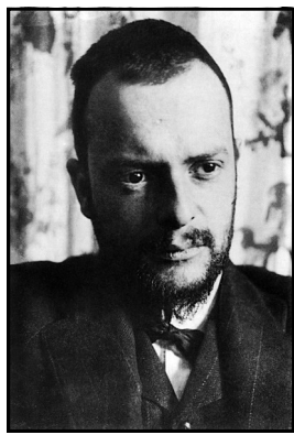
PAUL KLEE (1879 - 1940)